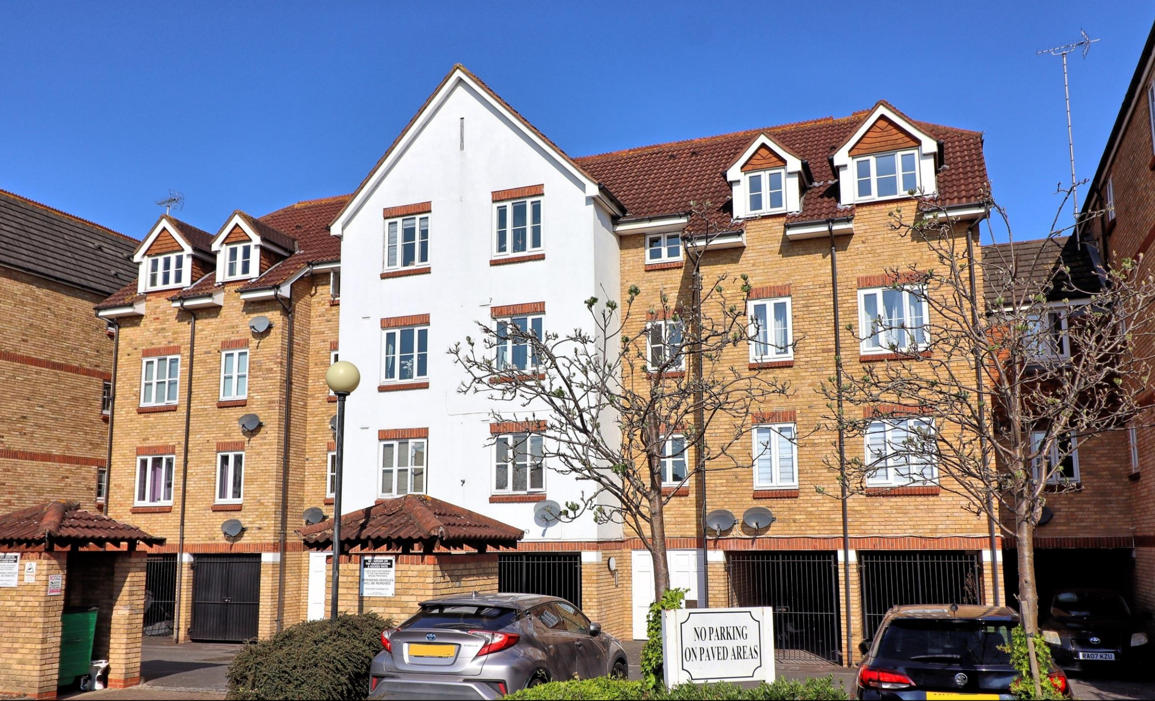
Highgrove Mews Grays