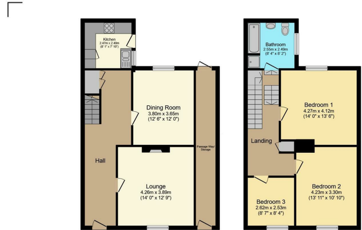
Ground Floor Floor area 66.7 sq.m. (718 sq.ft.) First Floor Floor area 56.7 sq.m. (610 sq.ft.) Total floor area: 123.4 sq.m. (1,328 sq.ft.)

This floor plan is for illustrative purposes only. It is not drawn to scale. Any measurements, floor areas (including any total floor area), openings and orientations are approximate. No details are guaranteed, they cannot be relied upon for any purpose and do not form any part of any agreement. No liability is taken for any error, omission or misstatement. A party must rely upon its own inspection(s). Powered by www.Propertybox.io