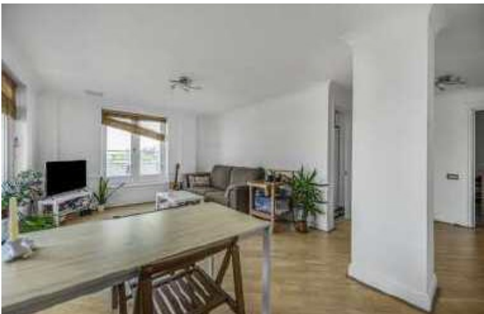
Odessa Street, SE16