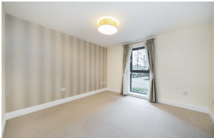
Spa Road, SE16