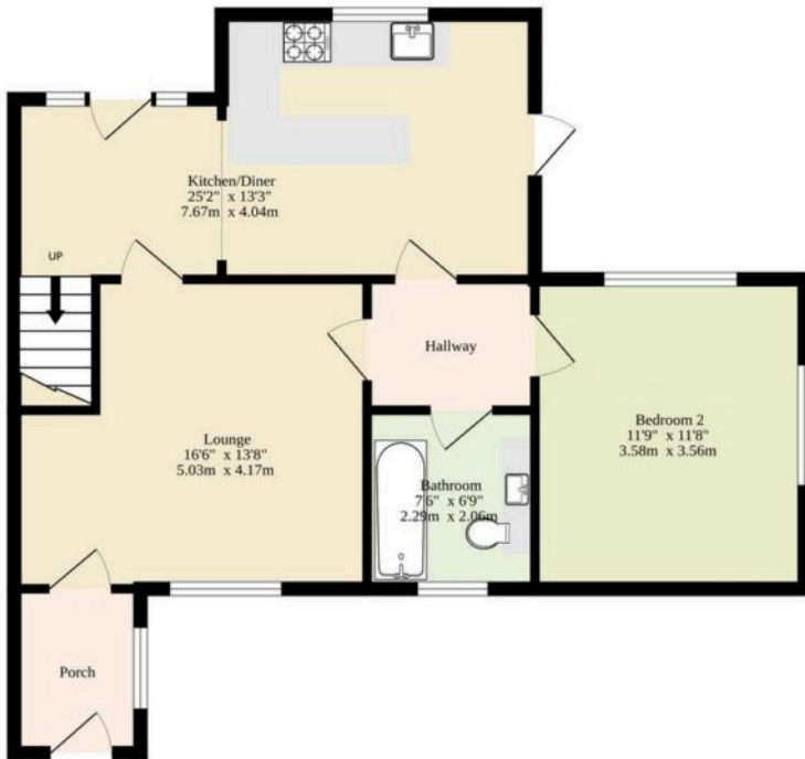
Ground Floor 808 sq.ft. (75.1 sq.m.) approx.