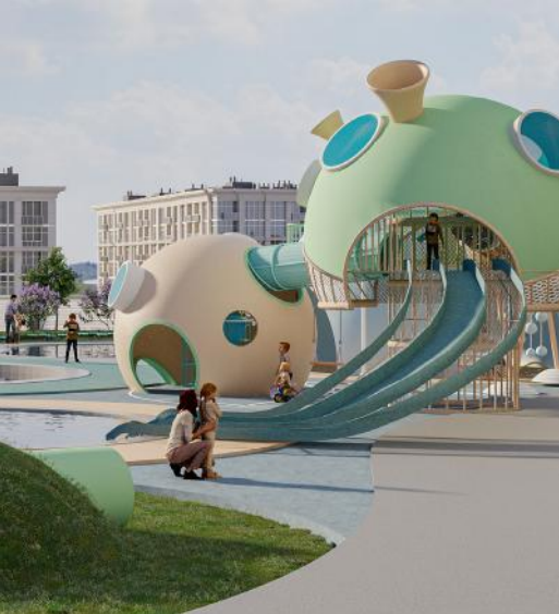
Disclaimer: All images used are for illustrative purposes only and do not represent the actual size, features, specifications, fittings, and furnishings. All materials, dimensions, and drawings are approximate only.