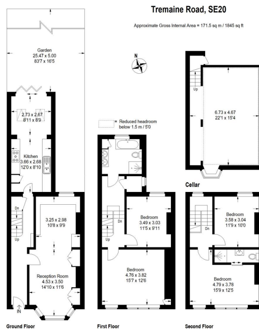
Illustration for identification purposes only, measurements are approximate, not to scale. Fourtubs.co © 2025 (101181864)