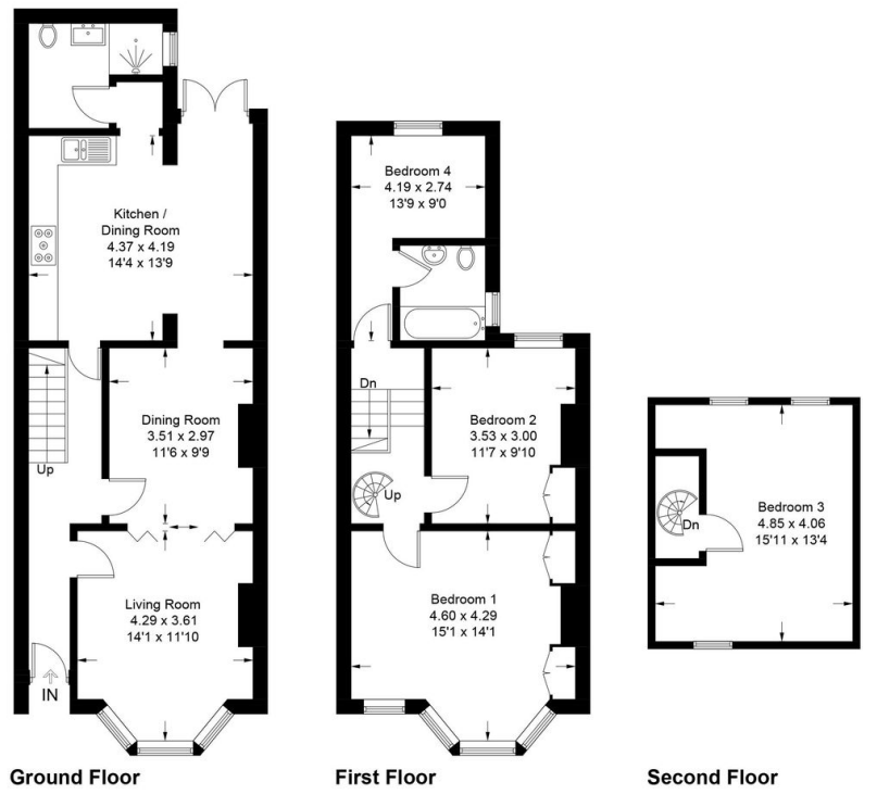
Approximate Gross Internal Area = 127.5 sq m / 1372 sq ft

Illustration for identification purposes only, measurements are approximate, not to scale. Fourlabs.co © (ID1159916)