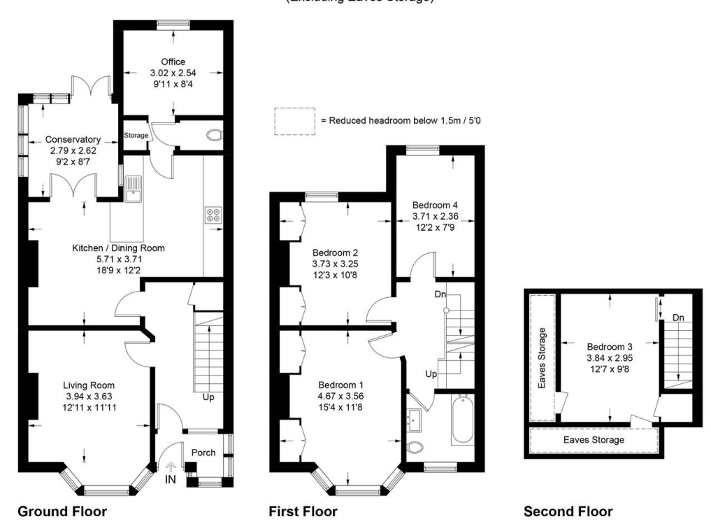
Illustration for identification purposes only, measurements are approximate, not to scale. Fourlabs.co @ (ID1158538)

Approximate Gross Internal Area = 137.1 sq m / 1476 sq ft (Excluding Eaves Storage)