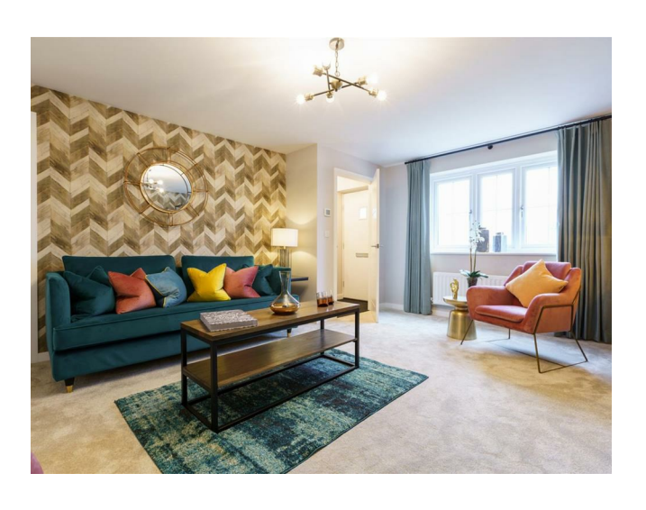
Image carousel may contain artists impressions and photography showing optional extras