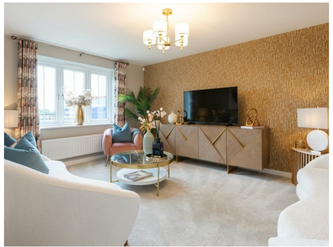
Image carousel may contain artists impressions and photography showing optional extras