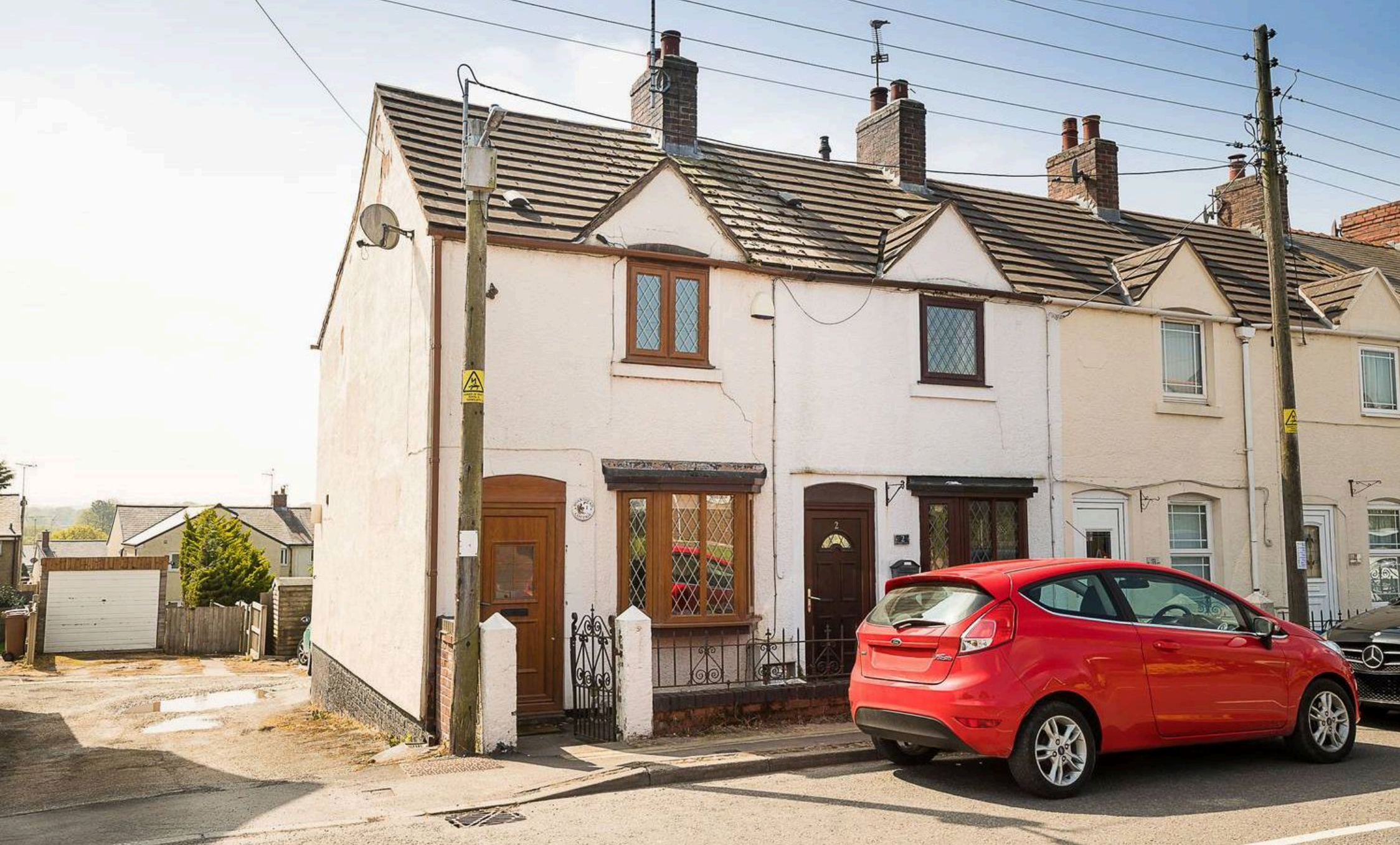
1 Boars Head Cottages Village Road, Northop Hall £160,000