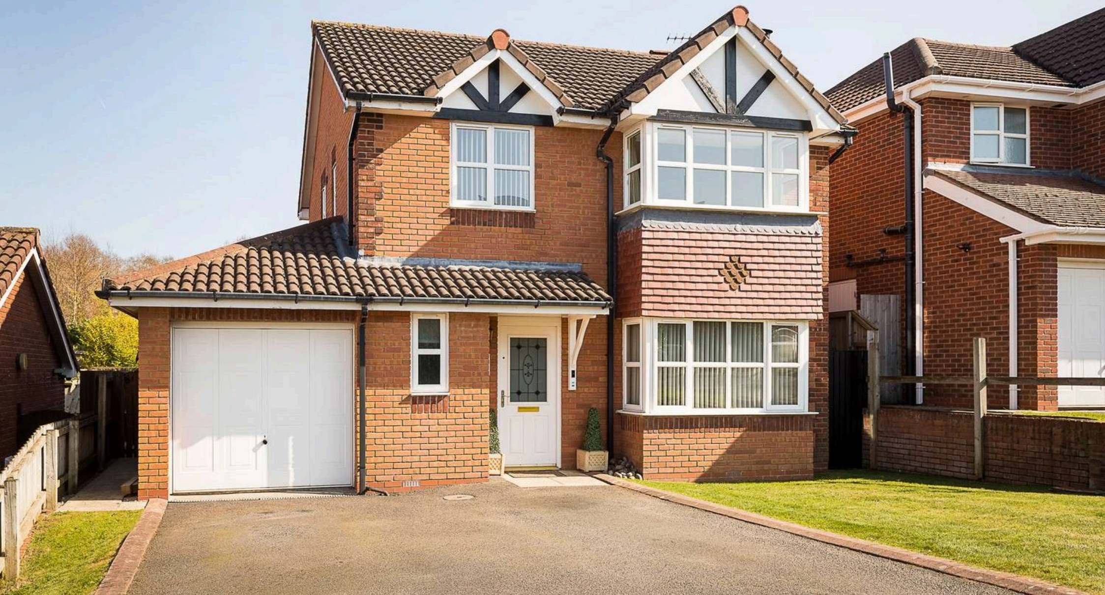
6 Caerphilly Road, Buckley £360,000