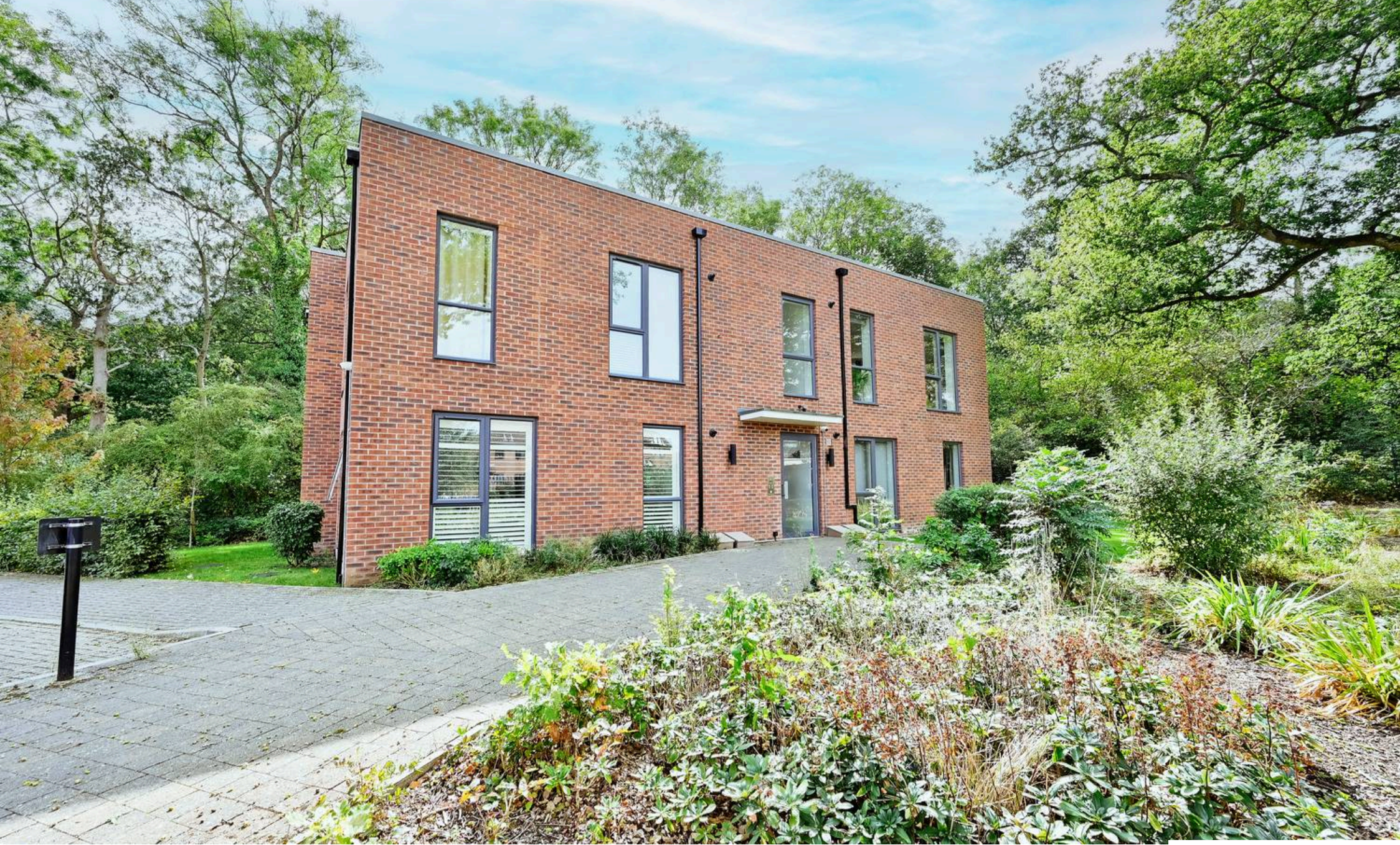
31 Chess Court, Heysham Drive – WD19 6AF £365,000