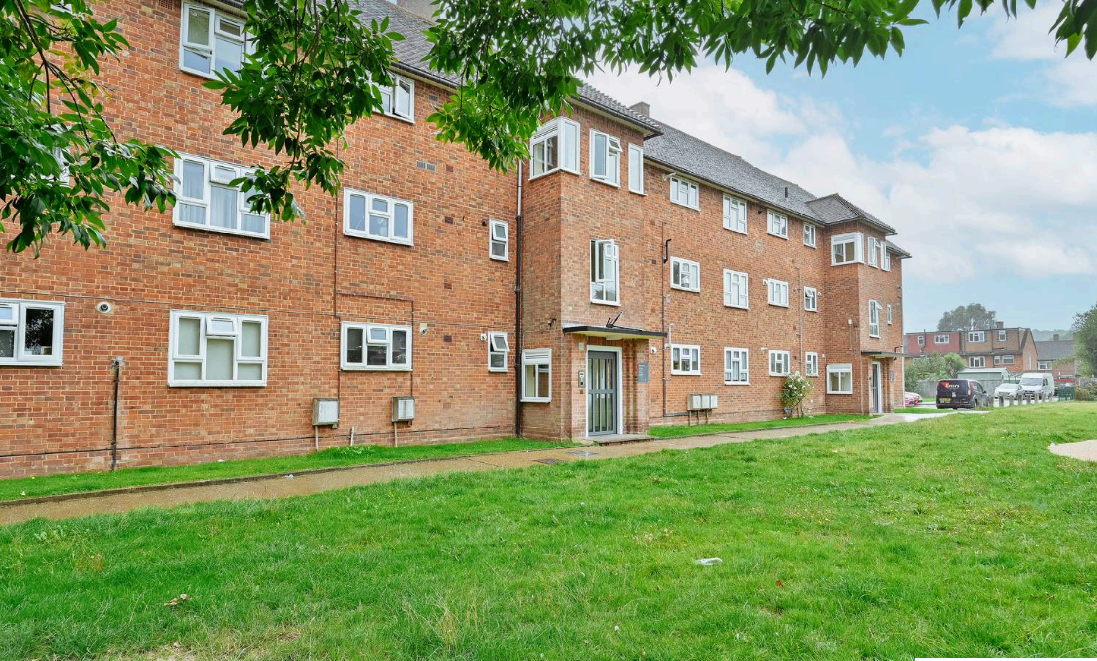
16 Filton House Oxhey Drive, Watford – WD19 7SQ £230,000