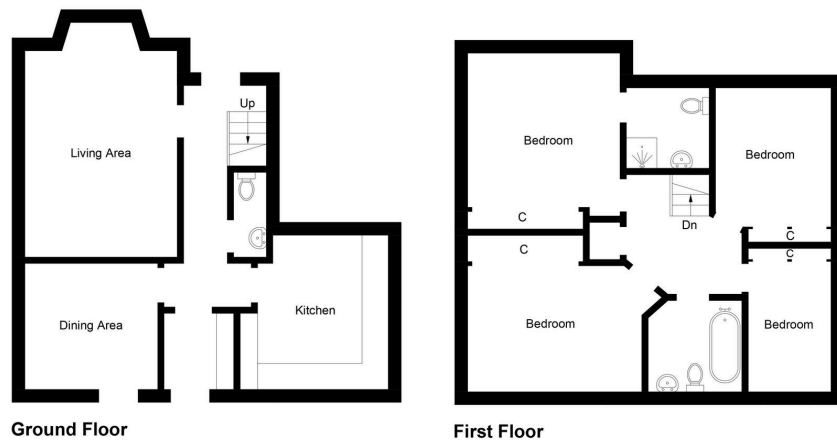
Illustration for identification purposes only, measurements are approximate, not to scale. Fourlabs.co © (ID1245143)