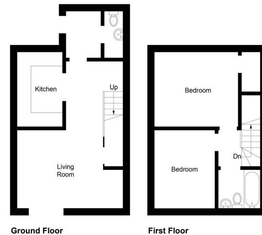
Illustration for identification purposes only. measurements are approximate, not to scale. Fourlabs.co © (ID1206697)