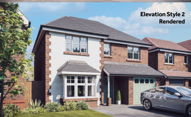
Elevation Style 2 Rendered