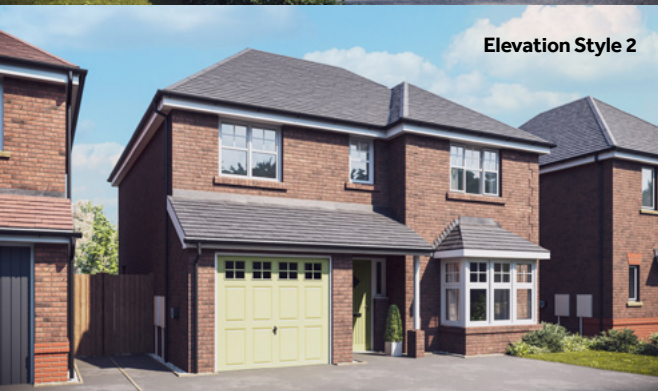
Elevation Style 2