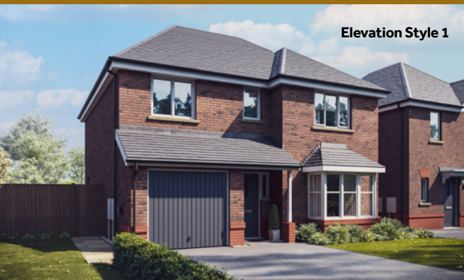
Elevation Style 1