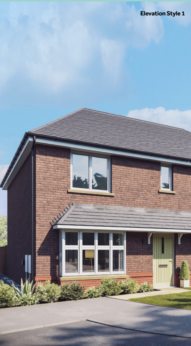
Elevation Style 1

NOTE: Customers should note images (CGIs) are for illustrative purposes only. All room dimensions are approximate and furniture layout is for illustrative purposes. Homes may be 'handed' (mirror image) versions of illustrations, and could be detached, semi-detached or terraced. Material and specifications will vary from site to site and plot to plot, including rendering and roof colours. Detailed plans and specifications for each plot is available to view at our sales centre during working hours. Please consult with your Sales Executive to make your own enquiries to check individual property details and specifications before making a reservation.