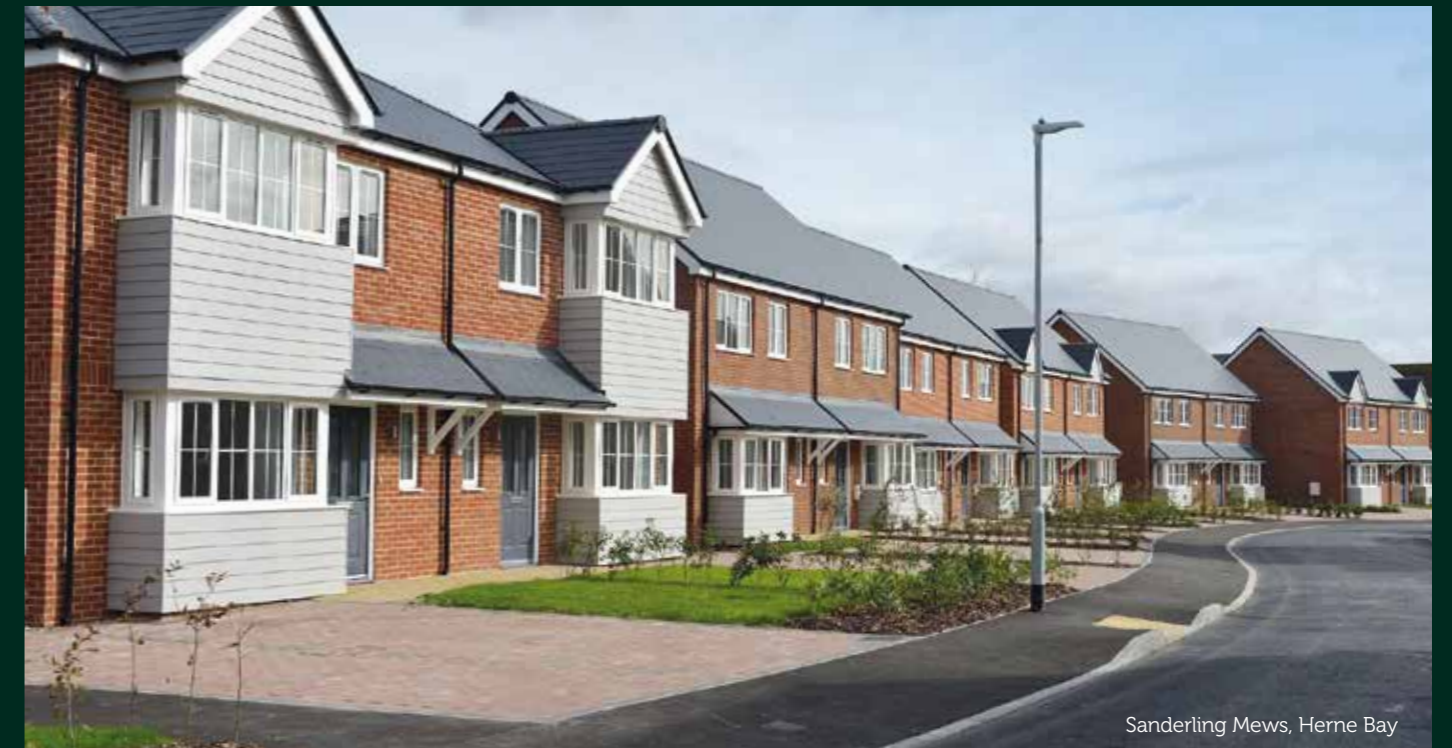
Sanderling Mews, Herne Bay