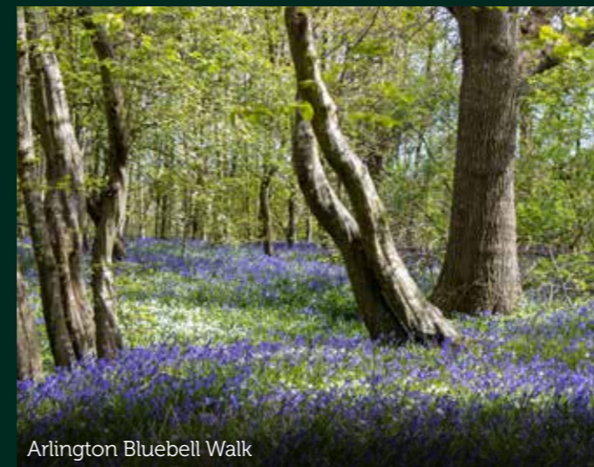
Arlington Bluebell Walk