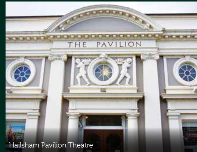
Hailsham Pavilion Theatre