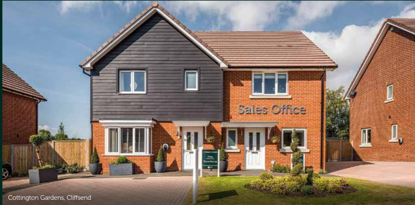
Cottington Gardens, Cliffsend