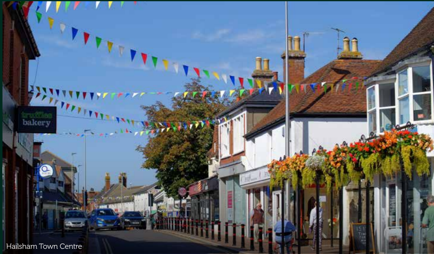
Hailsham Town Centre