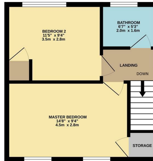
1ST FLOOR 336 sq.ft. (31.2 sq.m.) approx.