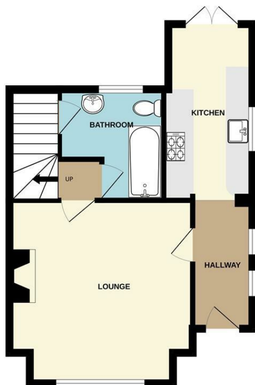
GROUND FLOOR 399 sq.ft. (37.1 sq.m.) approx.