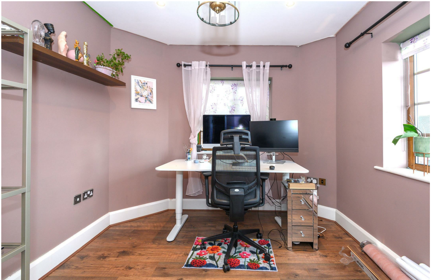
1 The Brambles, Royston, S71 4TA