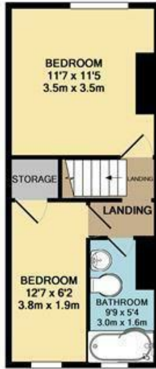
1ST FLOOR APPROX. FLOOR AREA 300 SQ.FT. (27.9 SQ.M.)

MEADWOHALL ROAD, ROTHERHAM, S61 2JW TOTAL APPROX. FLOOR AREA 608 SQ.FT. (56.5 SQ.M.)