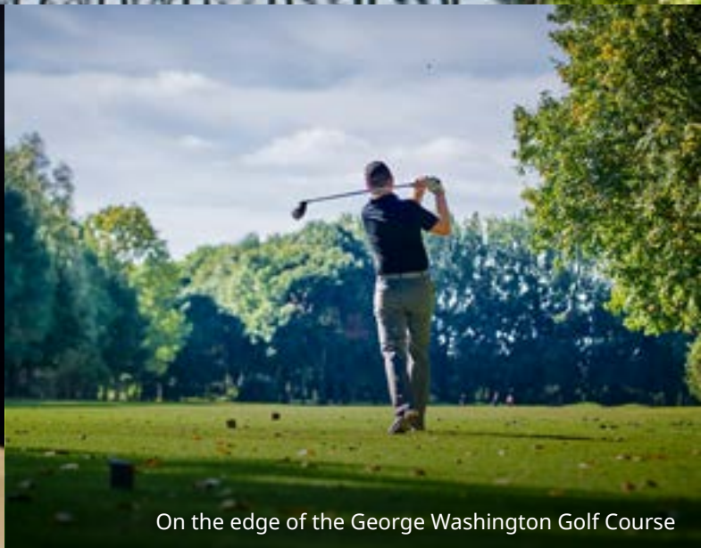
On the edge of the George Washington Golf Course