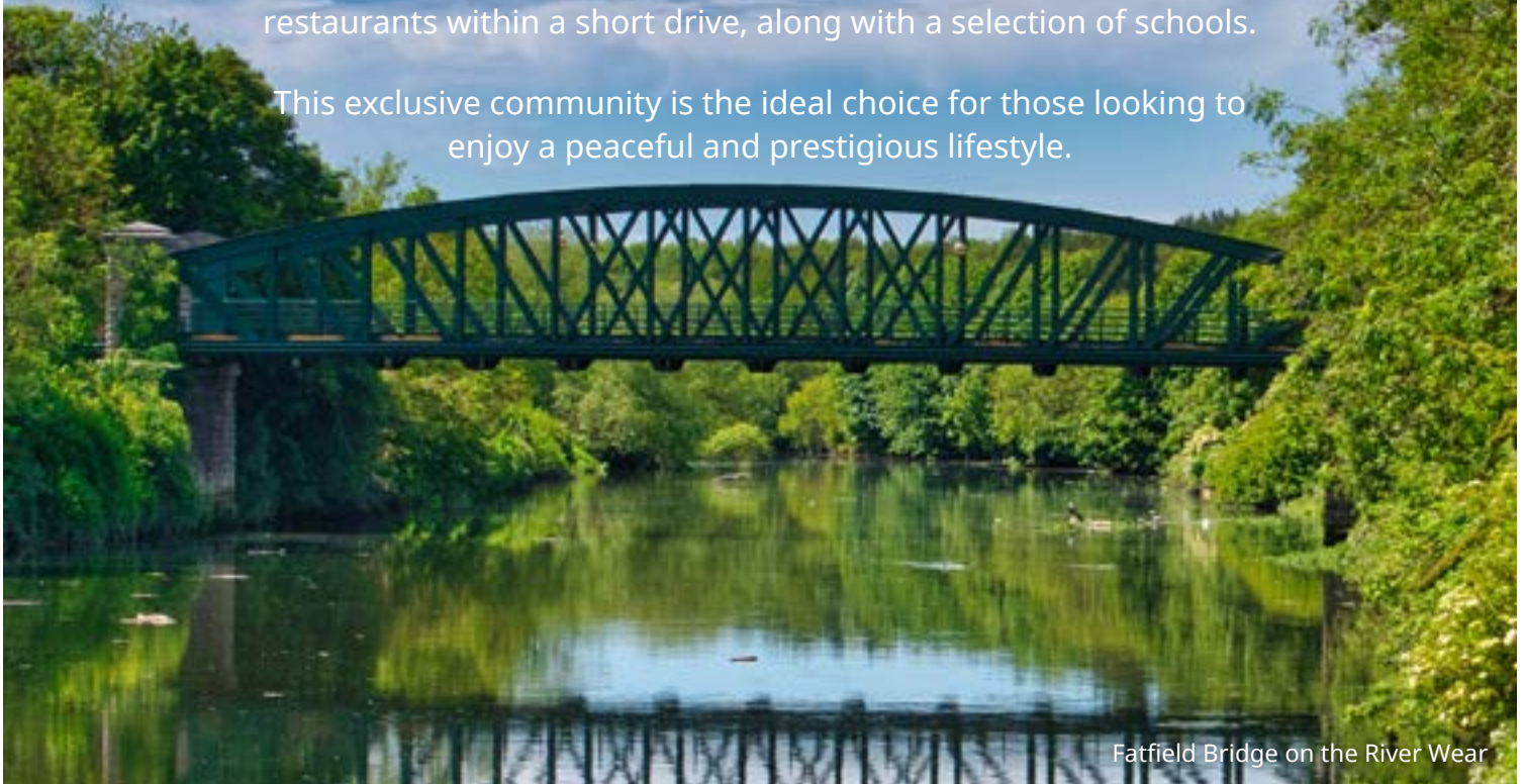
Fatfield Bridge on the River Wear

This exclusive community is the ideal choice for those looking to enjoy a peaceful and prestigious lifestyle.