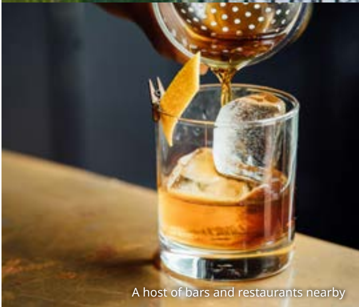
A host of bars and restaurants nearby