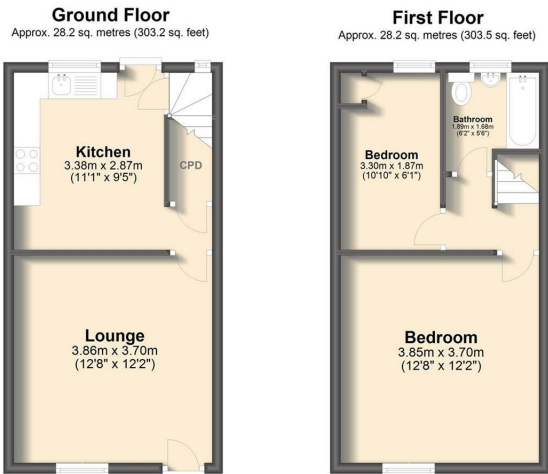
Total area: approx. 56.4 sq. metres (606.7 sq. feet)