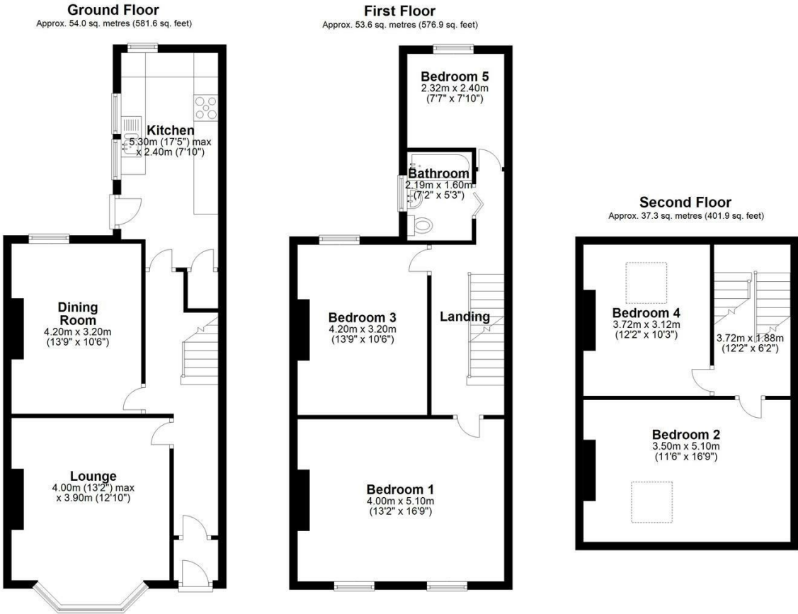
Total area: approx. 145.0 sq. metres (1560.5 sq. feet)

Nature lovers and outdoor enthusiasts will appreciate the abundance of nearby green spaces, with Millhouses Park, Ecclesall Woods, and even the Peak District National Park all within easy reach.