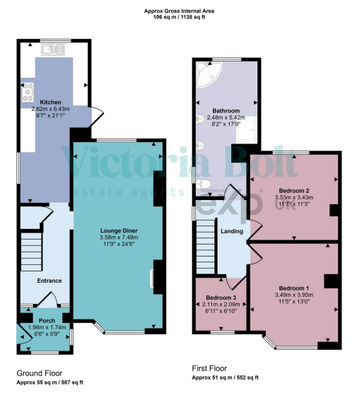
This floorplan is only for illustrative purposes and is not to scale. Measurements of rooms, doors, windows, and any items are approximate and no responsibility is taken for any error, organisation or mis-statement. Loops of items such as bathroom suites are representations only and

A bright and spacious extended three-bedroom semi-detached home in a quiet and convenient part of Plymouth. Featuring an open-plan lounge/diner, a south-facing low-maintenance garden with a BBQ area, driveway, garage with an office at the rear, and easy access to local amenities and transport links—this is a perfect family home.