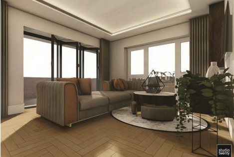
Furnished Two Bedroom Apartment Vanquish Mill Highcross Street, Leicester, \pounds 1,325