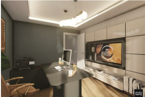
Penthouse Apartment Vanquish Mill Highcross Street, Leicester, LE1 4PJ £1,100