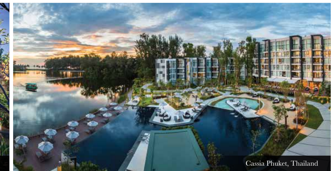
Cassia Phuket, Thailand