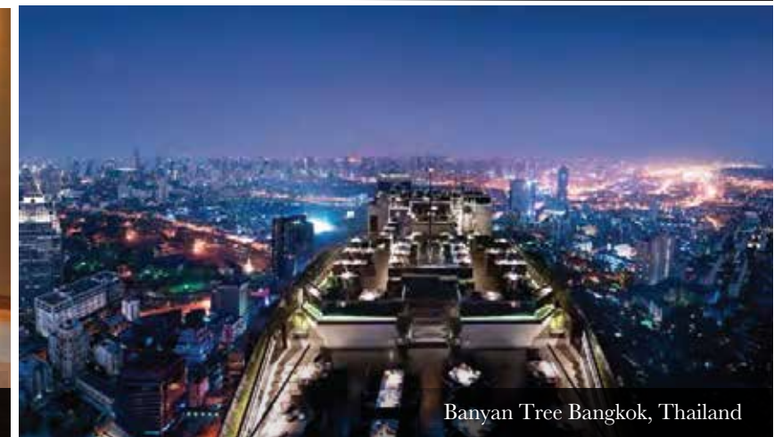
Banyan Tree Bangkok, Thailand