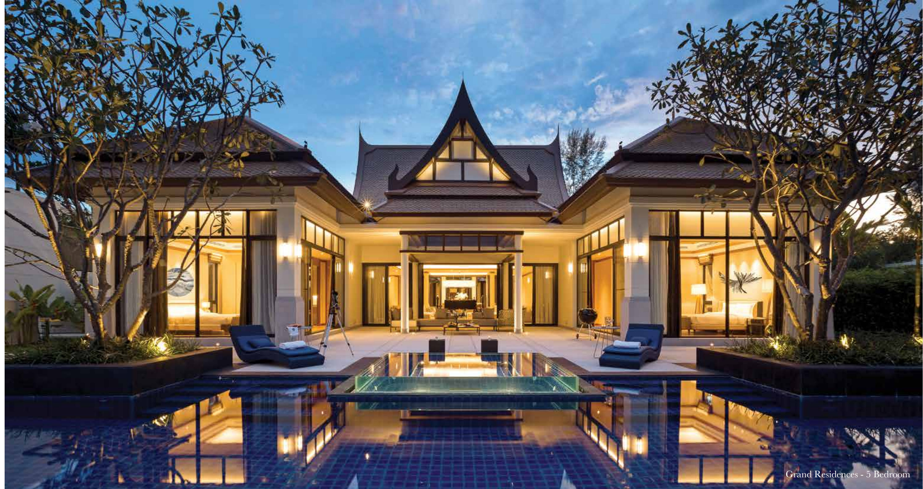
Grand Residences - 5 Bedroom

Each Grand Residences villa is designed to provide the best possible family home, creating the scope to add your own finishing touches and flourishes of colour. The combined skills of Banyan Tree's artisans and experts have crafted living spaces that are distinctly and uniquely sophisticated.