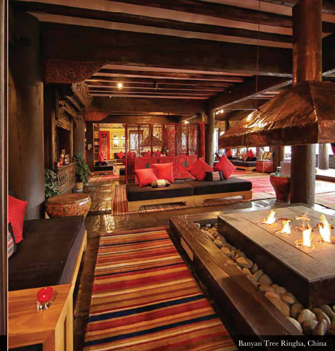
Banyan Tree Ringha, China