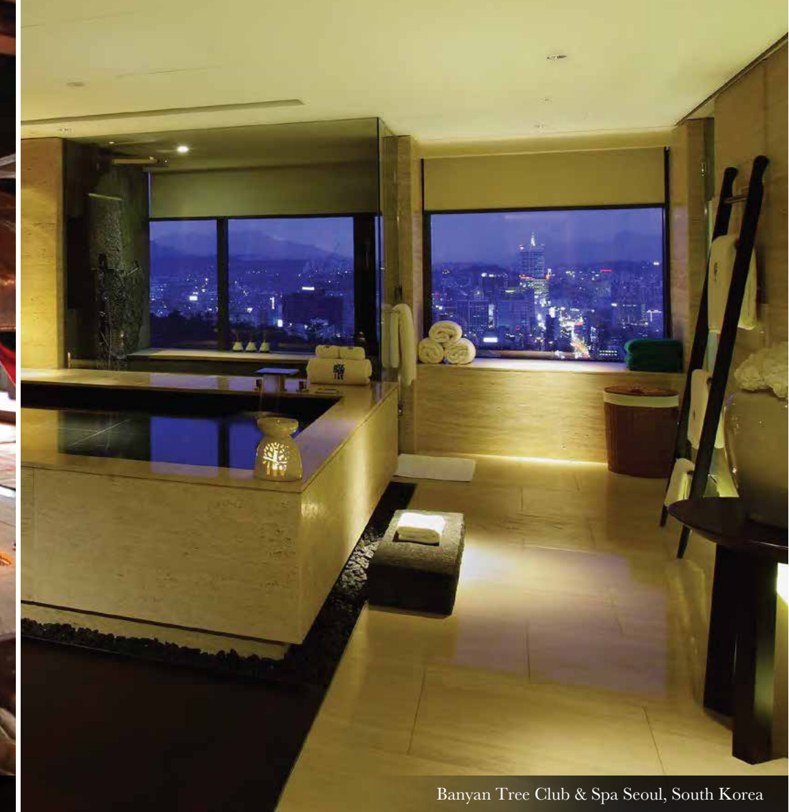
Banyan Tree Club & Spa Seoul, South Korea