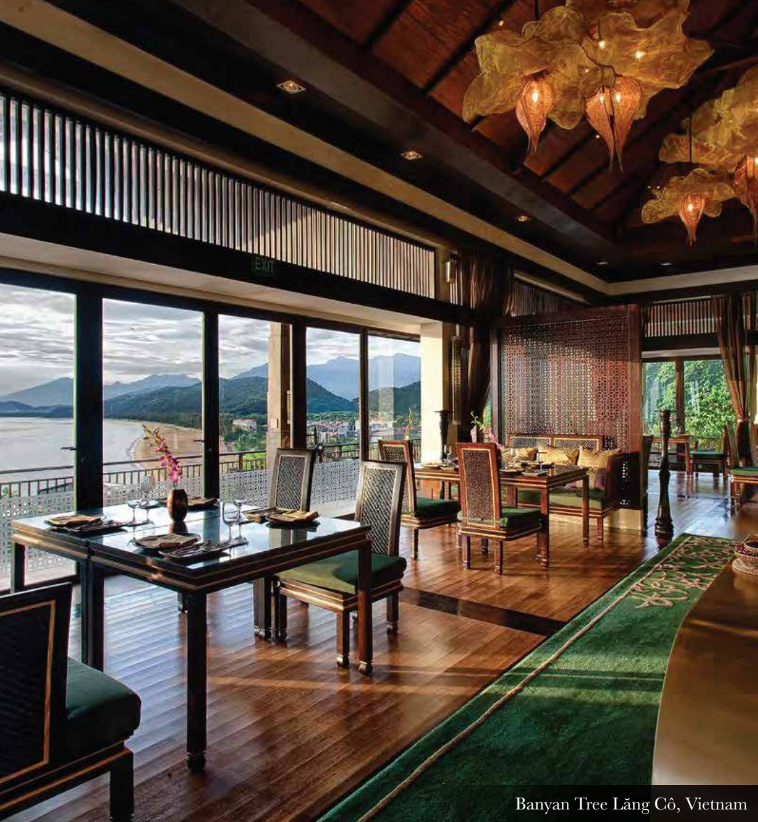
Banyan Tree Lăng Cô, Vietnam