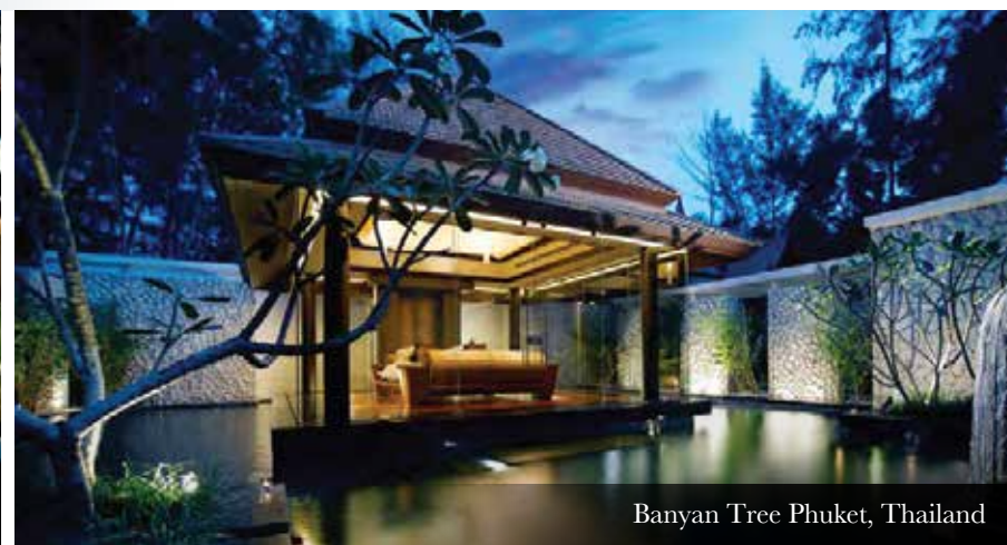
Banyan Tree Phuket, Thailand