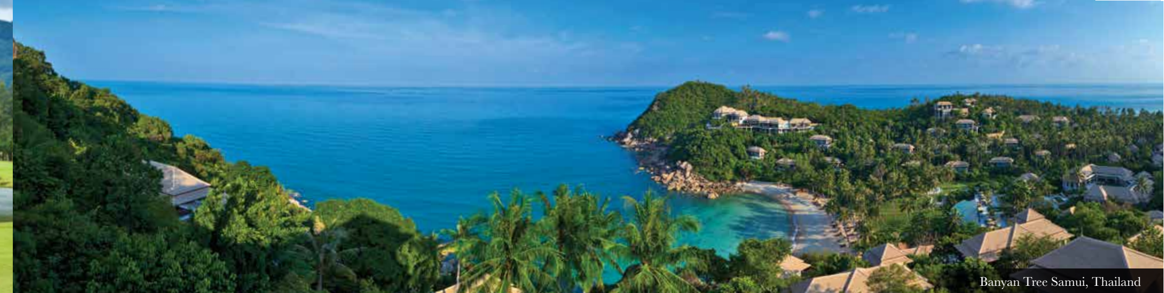
Banyan Tree Samui, Thailand