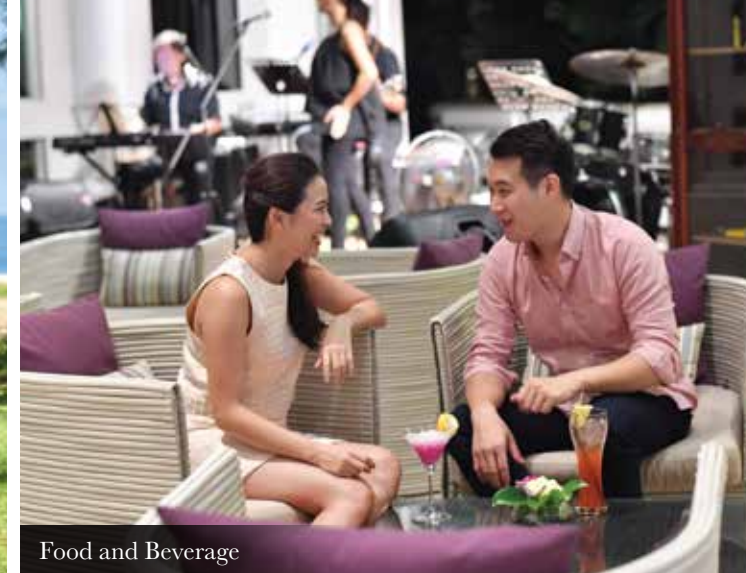
Food and Beverage