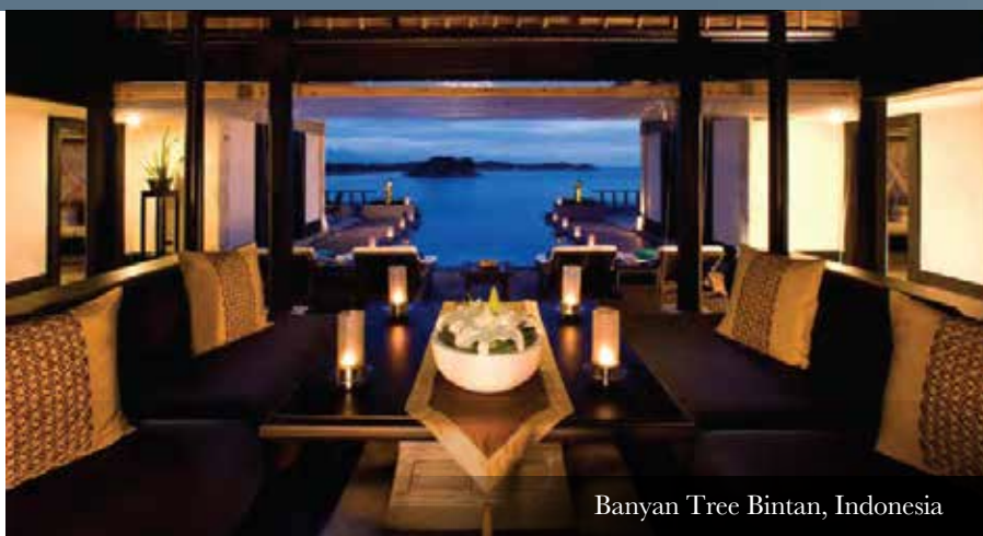
Banyan Tree Bintan, Indonesia