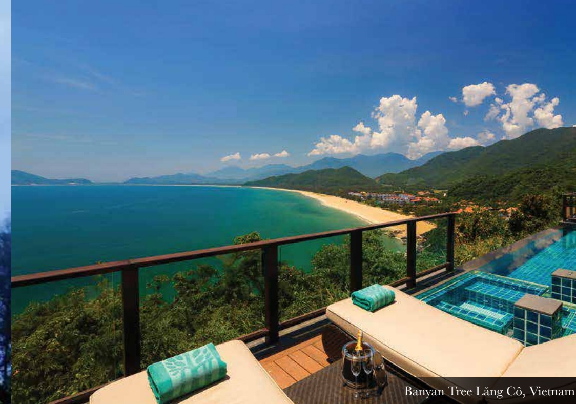
Banyan Tree Lăng Cô, Vietnam

With attentive yet discreet service and associates representing more than 50 nationalities, the Banyan Tree Group provides luxurious, ecological and culturally sensitive experiences for the discerning traveller. The result is a blend of beauty, practicality, outstanding service and award winning facilities. At home at Banyan Tree in Laguna Phuket you will discover and enjoy a lifestyle exclusively yours to own.