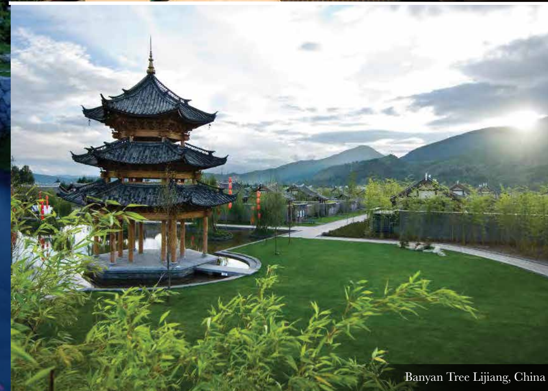
Banyan Tree Lijiang, China