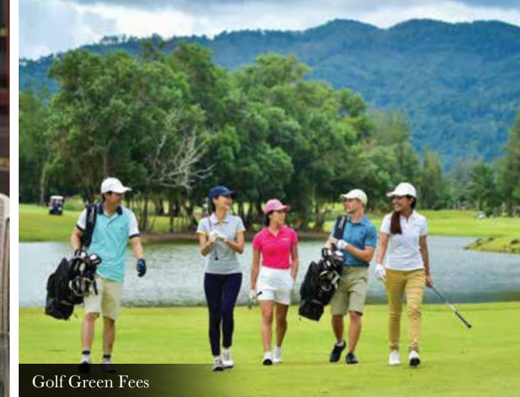
Golf Green Fees