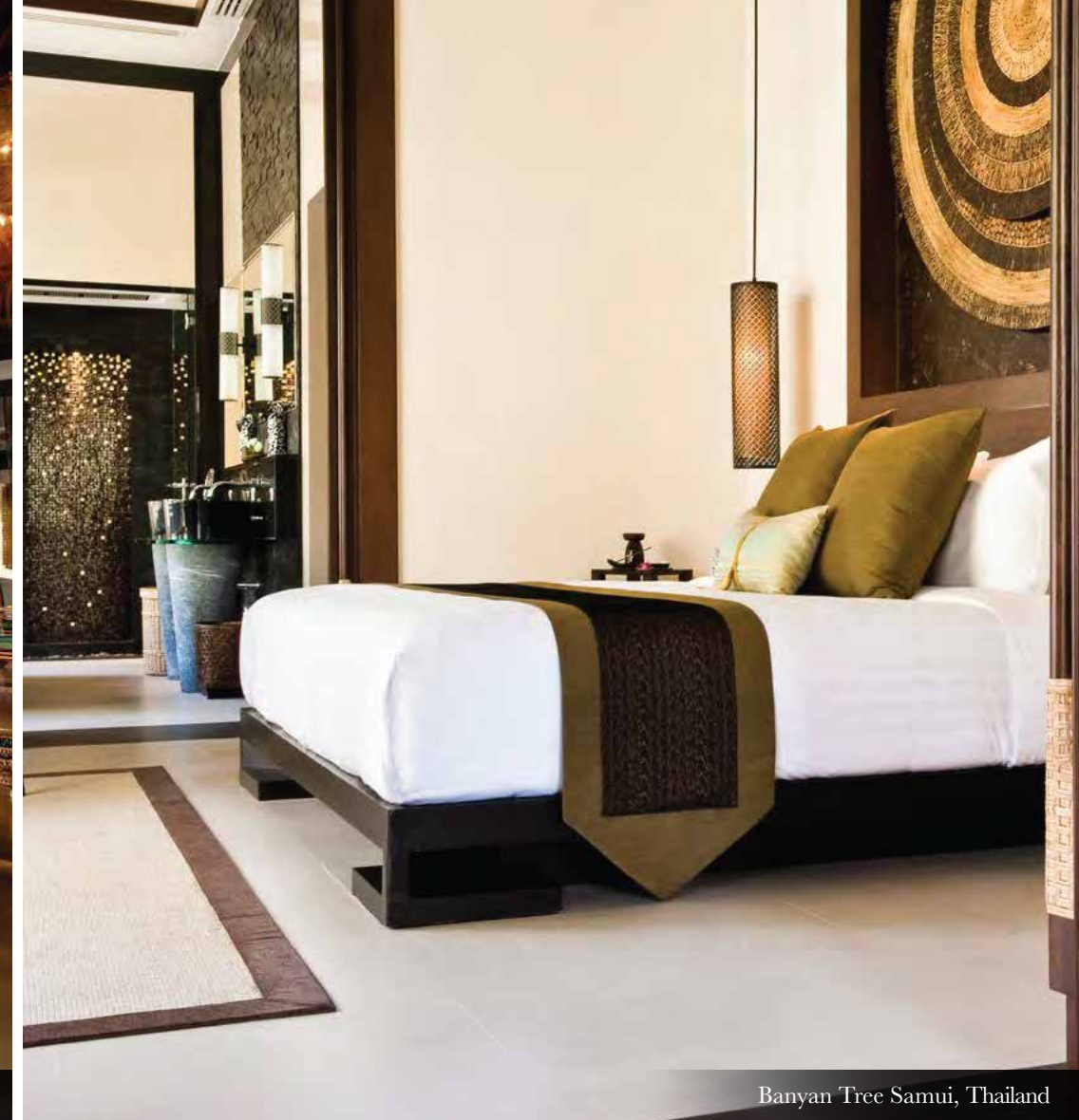
Banyan Tree Samui, Thailand