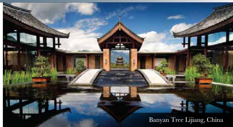
Banyan Tree Lijiang, China