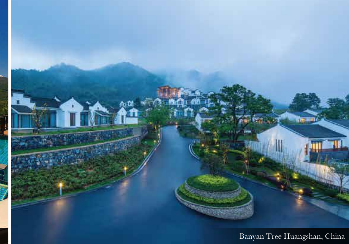
Banyan Tree Huangshan, China