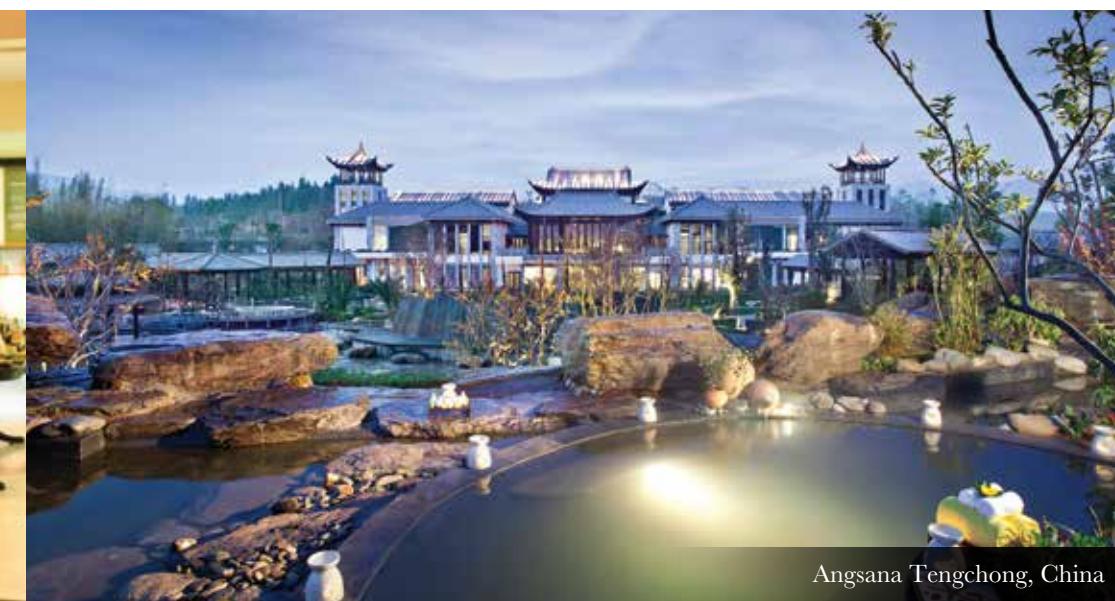
Angsana Tengchong, China