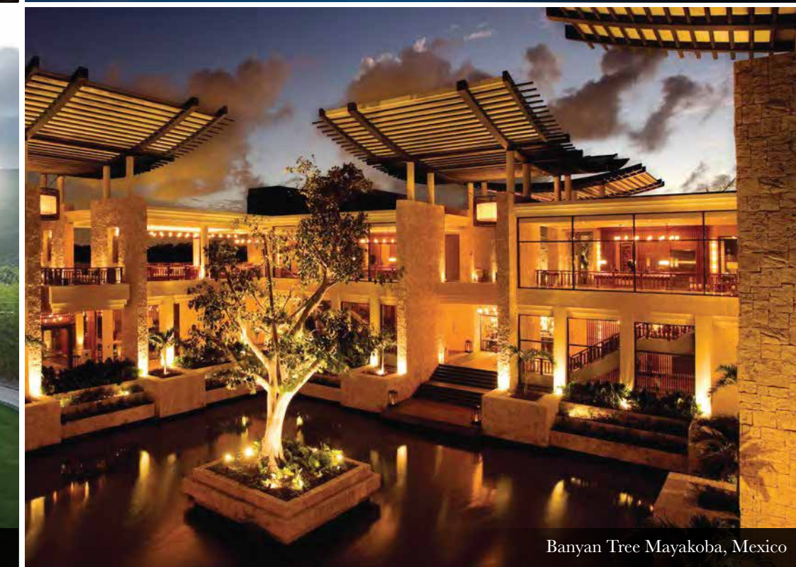
Banyan Tree Mayakoba, Mexico