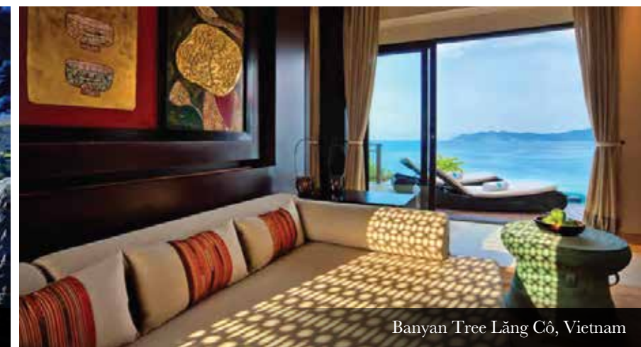
Banyan Tree Lăng Cô, Vietnam