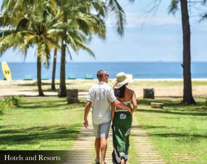
Hotels and Resorts