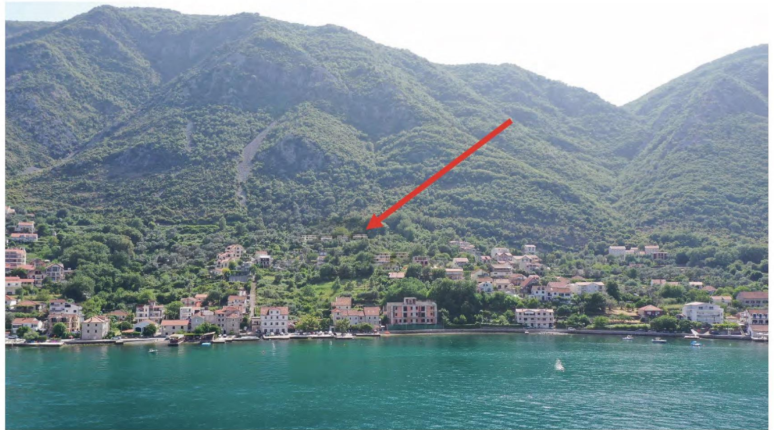
The Village of Prčanj and Location of the Villas

The village is just 7 kms from Kotor Old town and only 11kms (approximately 15 minutes by taxi) from the nearest airport, Tivat International Airport.