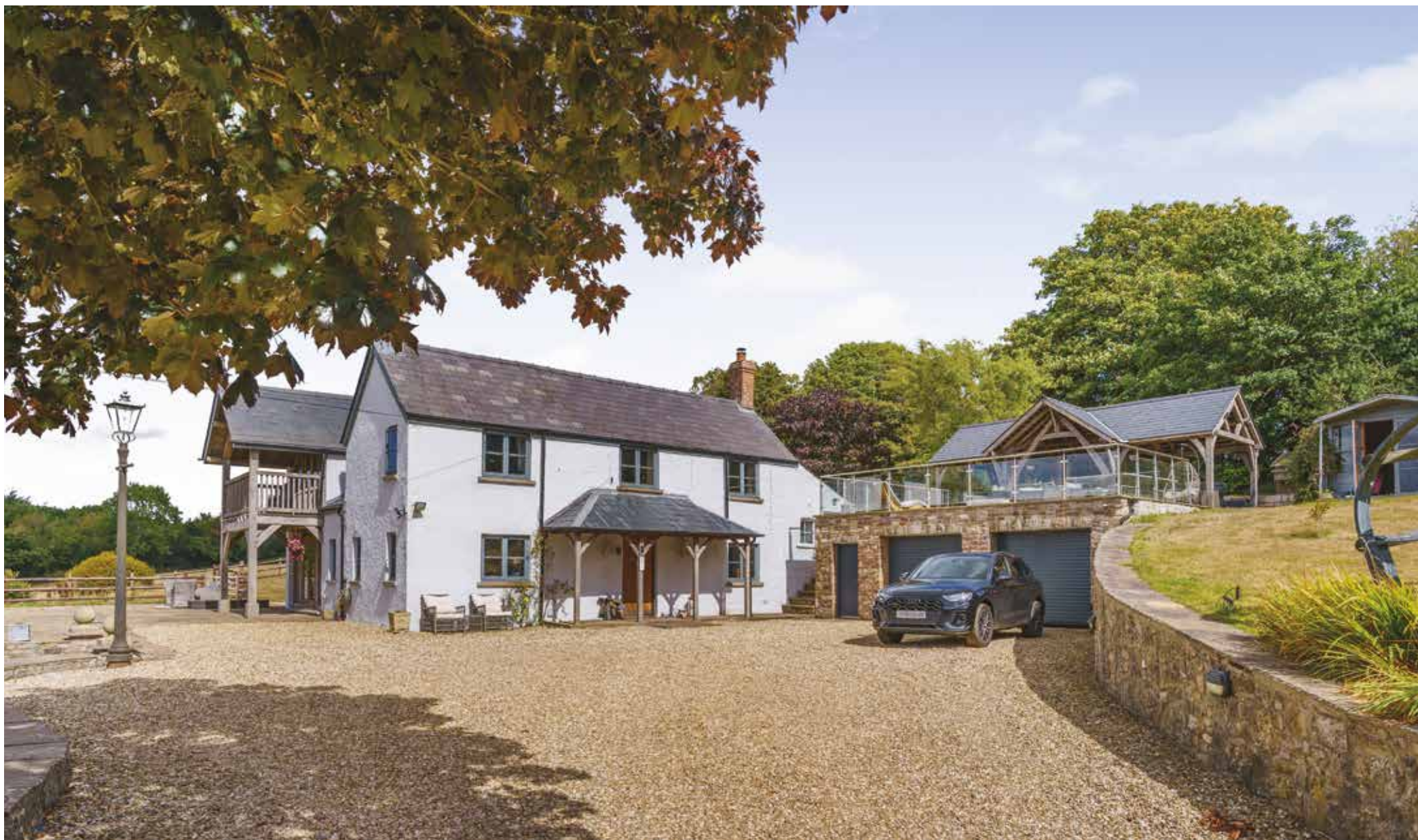
Sunnybank Farm Devauden | Chepstow | Monmouthshire | NP16 6NW