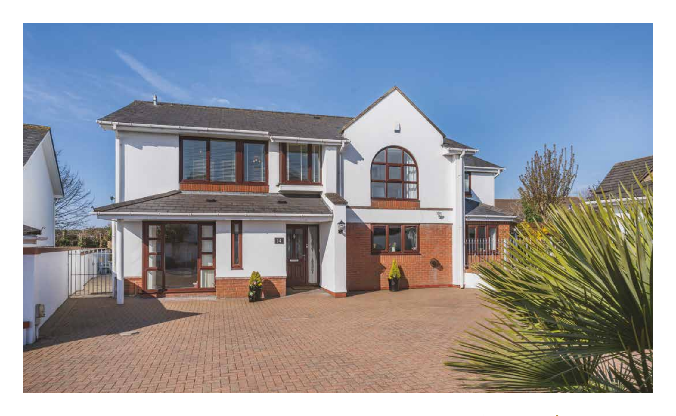
14 Lower Farm Court Rhoose | Barry | CF62 3HQ