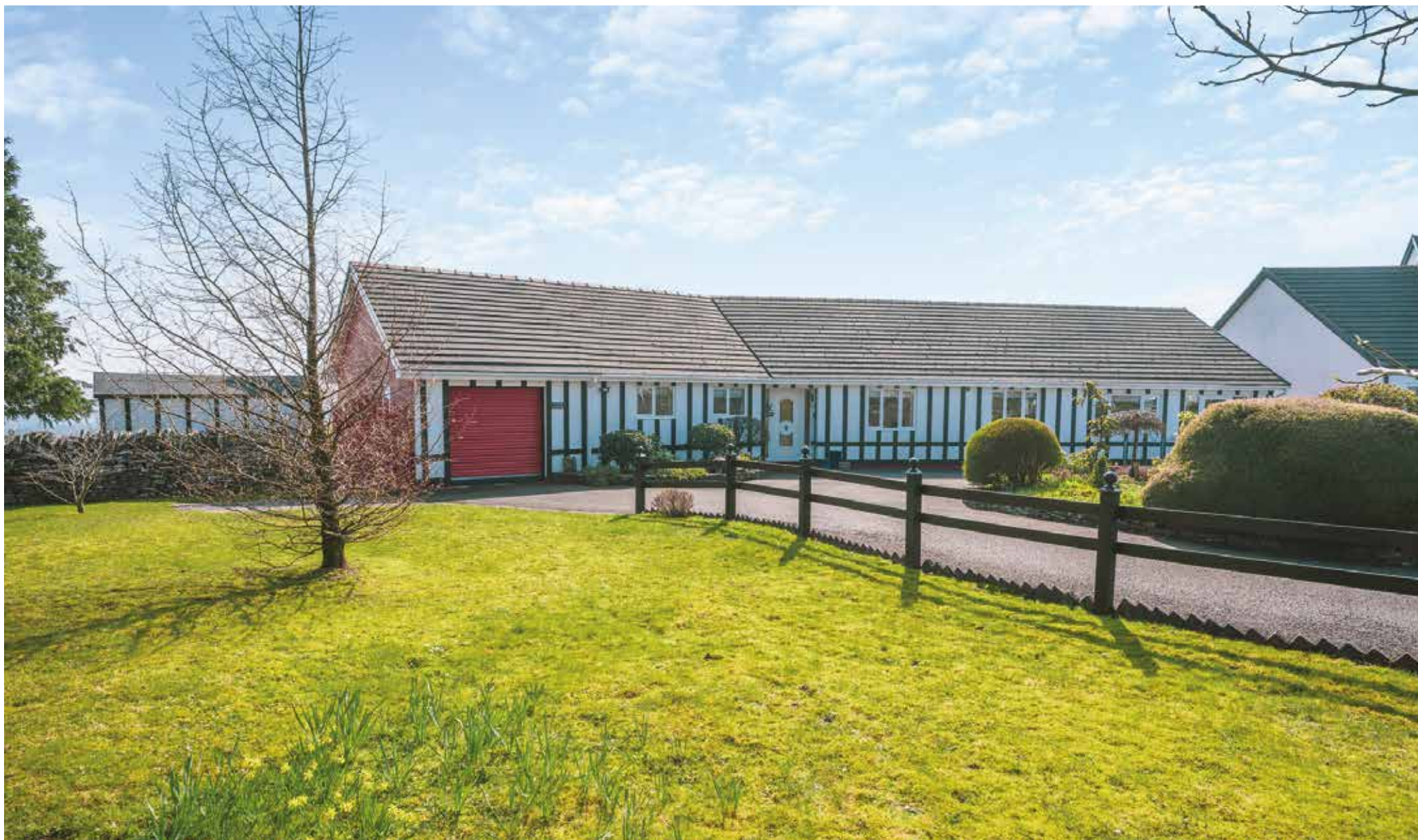
Garden Cottage Penycoedcae | Pontypridd | CF37 1PY