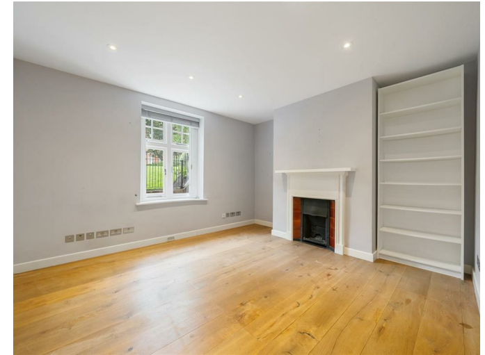
The Pryors, NW3

A spectacular three double bedroom apartment offering just under 1500 sq ft of well planned accommodation situated in a popular block offering off street parking and concierge located next to Hampstead Heath. This fantastic property comprises, double reception room with bay window, separate fully fitted chefs kitchen, principal bedroom with walk in wardrobe, two further double bedrooms, family bathroom and a family shower room. Additional benefits include wooden flooring throughout, extensive communal gardens and an external storage cupboard.