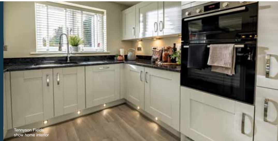
Tennyson Fields show home interior

* Subject to build stage from our selected range