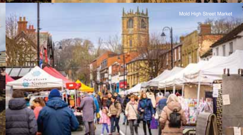
Mold High Street Market