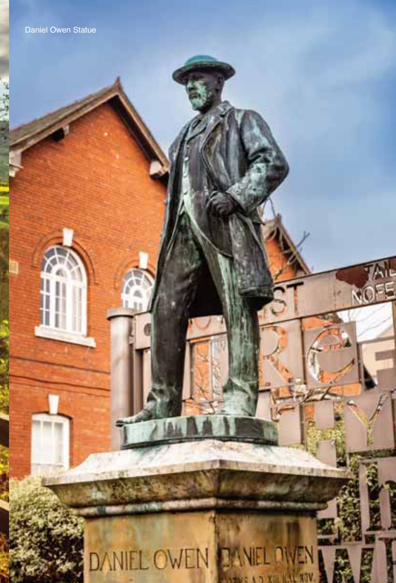
Daniel Owen Statue