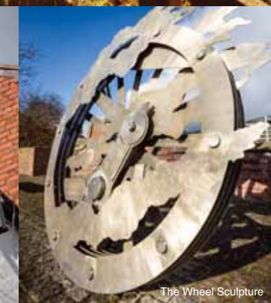
The Wheel Sculpture