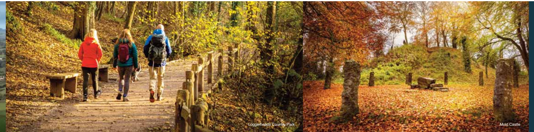
Loggerheads Country Park