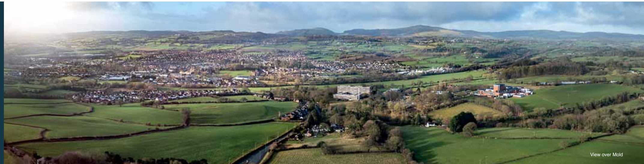
View over Mold

There's also the North Wales coastline to explore. Talacre Beach has miles of wind-swept golden sandy beach, beautiful dunes and the iconic Point of Ayr Lighthouse which dates back to 1776. For a more traditional family seaside trip, there's Prestatyn, Rhyl and Llandudno, with each offering its own unique charm and character. If you'd prefer a city trip, Chester is only 25-minutes by car. Ideal for taking in the many shops, rich history, café culture and seemingly non-stop entertainment.