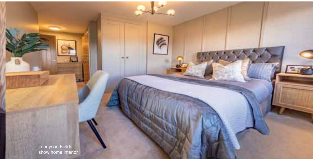
Tennyson Fields show home interior