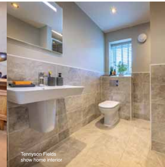
Tennyson Fields show home interior