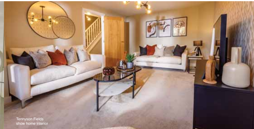
Tennyson Fields show home interior