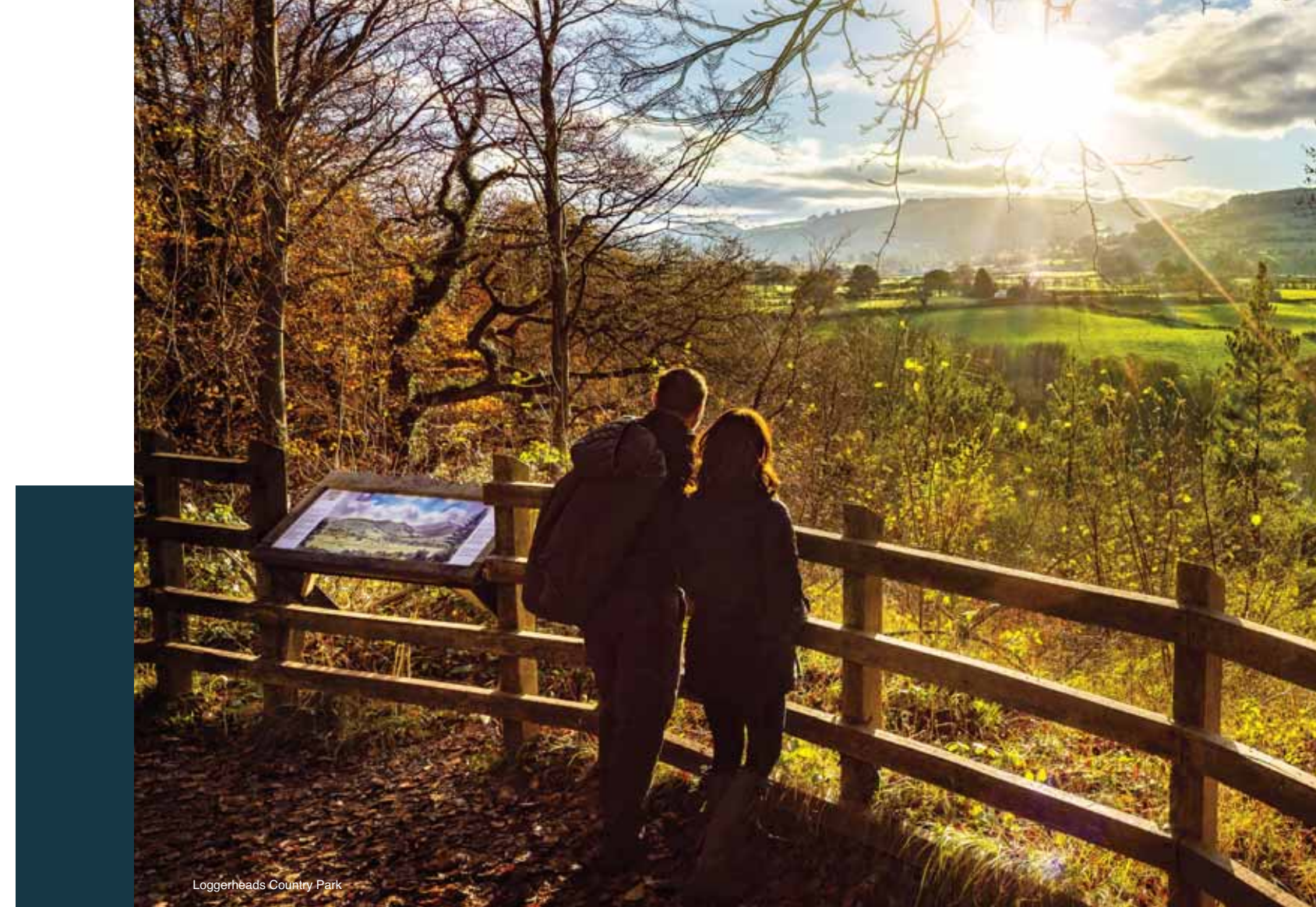
Loggerheads Country Park

Finally, you're going to need a new diary for Mold's wide range of events. These include an annual Food and Drink Festival, the biggest carnival in Flintshire and an eclectic mix of music festivals such as Live on the Square, M-Fest and the North Wales Blues and Soul Festival.