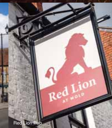
Red Lion Pub