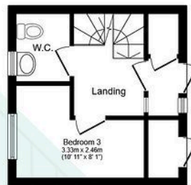
First Floor Floor area 18.0 sq.m. (194 sq.ft.)