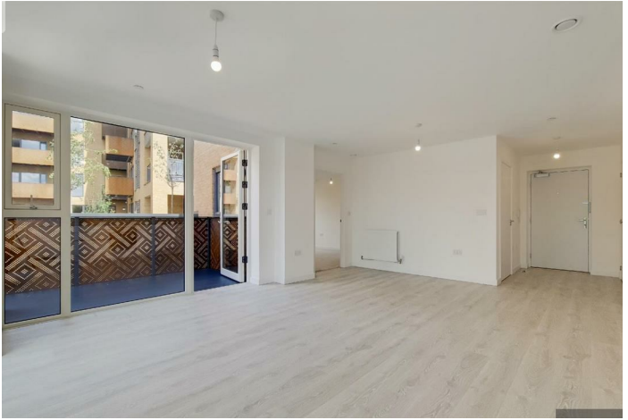
Flat - Purpose Built (EPC Rating: B)