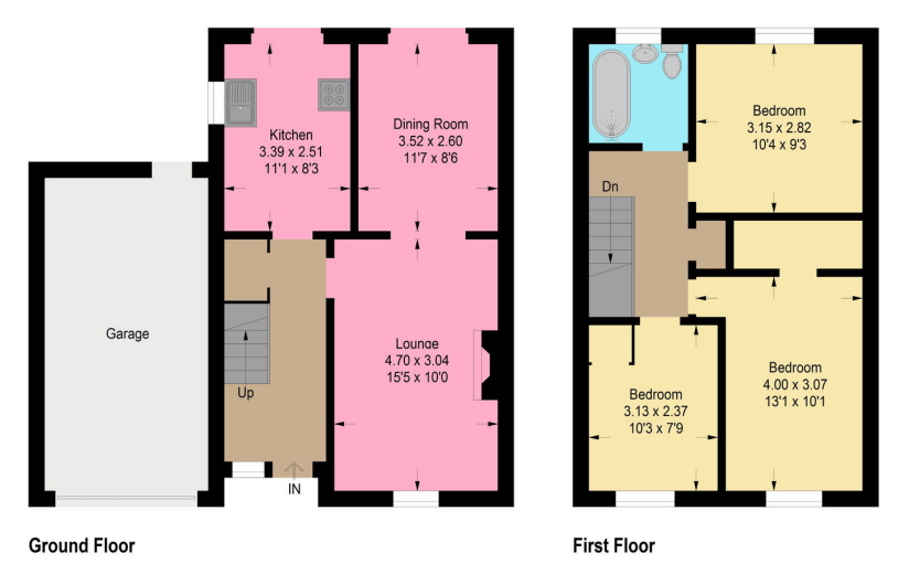
Illustration For Identification Purposes Only. Not To Scale (ID1193679 / Ref:90434)