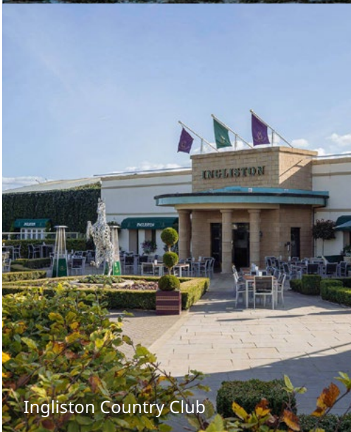
Ingliston Country Club