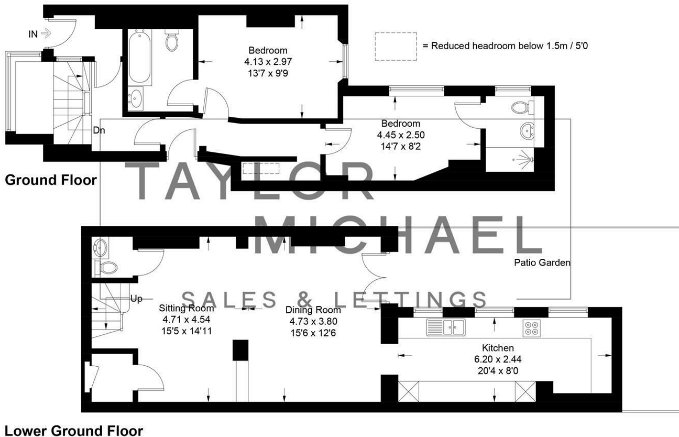
Illustration for identification purposes only, measurements are approximate, not to scale. Imageplansurveys @ 2025