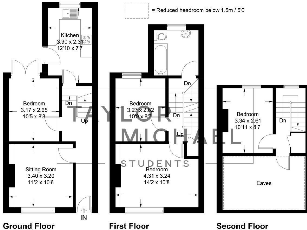
Illustration for identification purposes only, measurements are approximate, not to scale. Imageplansurveys @ 2025

E: lettings@taylormichael.agency T: https://taylormichael.agency/