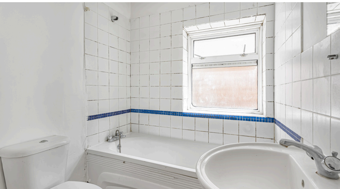
1/2 Bedroom ground floor garden flat