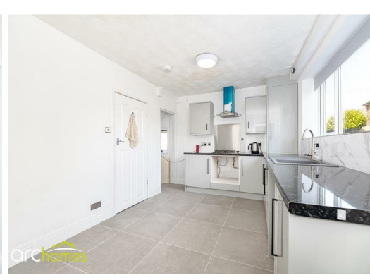
105 Market Street Hindley, WN2 3AA