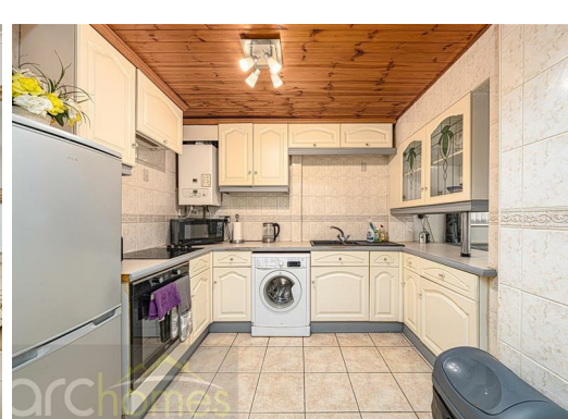
105 Market Street Hindley, WN2 3AA