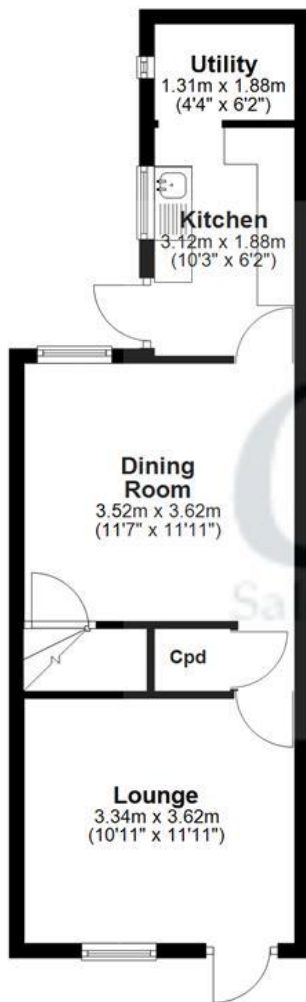
Ground Floor Approx. 37.3 sq. metres (402.0 sq. feet)