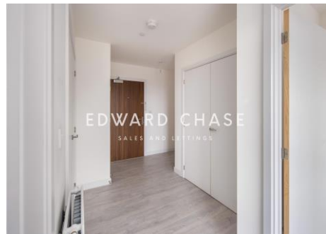
Harp View Apartments 2 bedroom apartment