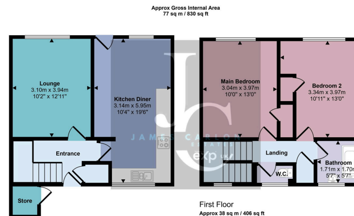
Ground Floor Approx 39 sq m / 424 sq ft

This floorplan is only for illustrative purposes and is not to scale. Measurements of rooms, doors, windows, and any items are approximate and no responsibility is taken for any error, omission or mis-statement. Icons of items such as bathroom suites are representations only and may not look like the real items. Made with Made Snappy 360.