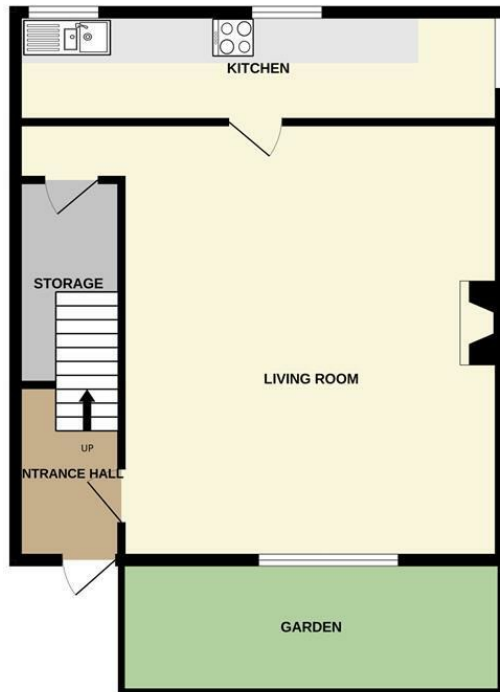
GROUND FLOOR 588 sq.ft. (54.6 sq.m.) approx.